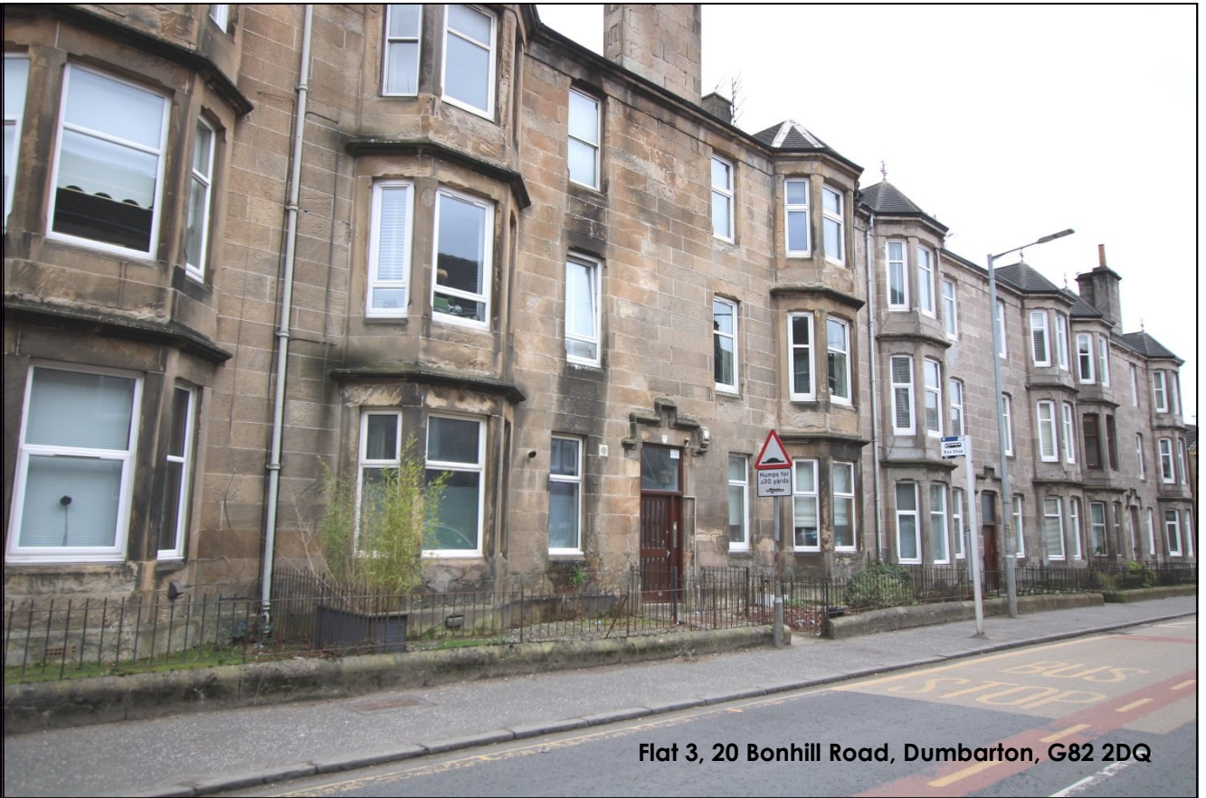
Flat 3, 20 Bonhill Road, Dumbarton, G82 2DQ

Superb 3 apartment first floor flat within the ever popular Bonhill Road address. Offering spacious apartments and a high level of specification flat is sure to attract interest from a wide range of the market.